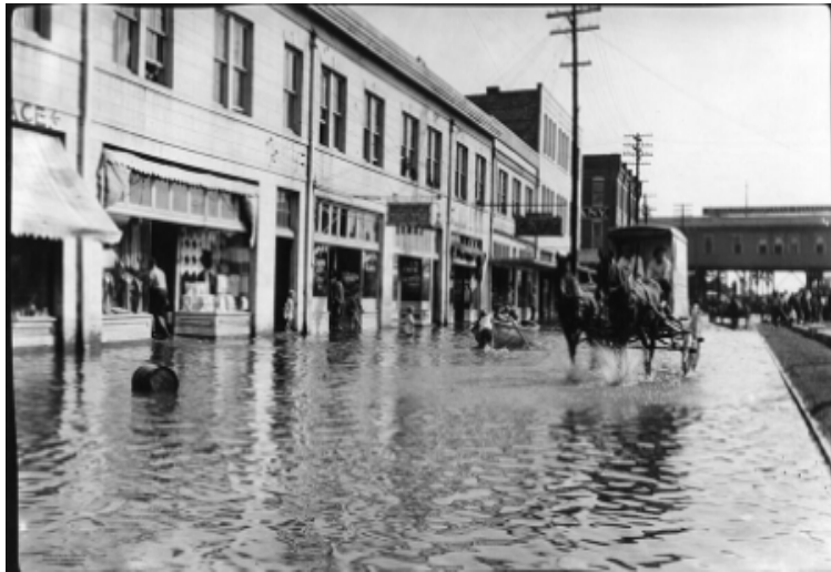
Flooding in Mobile, AL, 1916 (Erik Overbey Collection. The Doy Leale McCall Rare Book and Manuscript Library, University of South Alabama).

Storm surge occurs when waves and strong winds of a storm or hurricane, force water from gulfs, bays, and rivers onshore. Storm surge results in drastic changes in the sea level. Storm surges during major hurricanes (Category 3 to 5) measure between 20 to 30 feet (AMS 2017; Pilkey and Young 2009)