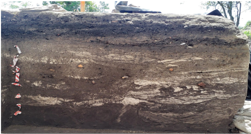
Storm deposits within unit profile in the MRB Project Area.