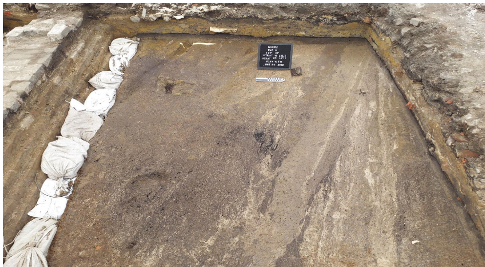
Storm deposits in an excavation unit, 1MB552.